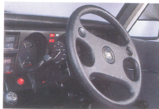
Power Steering helps you hug the road better, reduces steering effort and enhances safety.